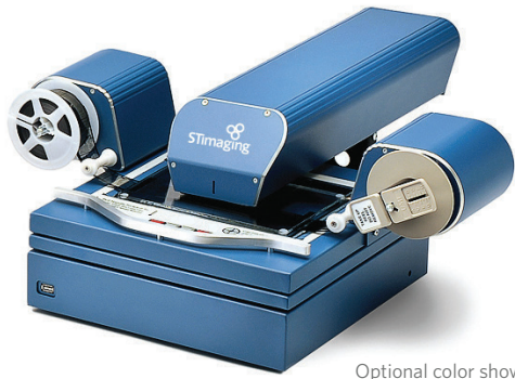
Optional color shown